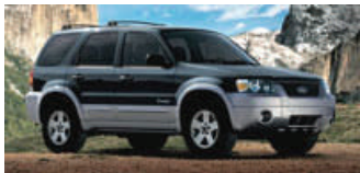
2006 Ford Motor Co. Escape Hybrid

City MPG: 60 Hwy MPG: 66 MSRP for Hybrid model: $19,330 Transmission/Engine: Manual 5-Speed CVT In-line 3 cylinder 1.0 L