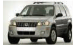
2006 Ford Motor Co.

City MPG: 36 Hwy MPG: 31 MSRP for Hybrid model: $27,515 Transmission/Engine: ECVT Duratec I-4 Atkinson Cycle 2.3L