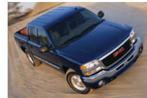
2006 GM - GMC Sierra

City MPG: 9 Hwy MPG: 12 MSRP: $27,985—$33,915 Transmission/Engine: 4 Speed Automatic Vortec 6000 6.0L