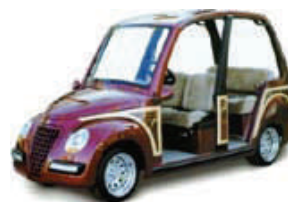
2006 Western Golf Cars Lido Sedan

City MPG: Unavailable Hwy MPG: Unavailable MSRP for Electric model: $14,500 Transmission/Engine: Dana Spicer 72V Advanced DC