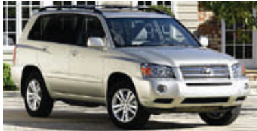
2006 Toyota Highlander

City MPG: 30 Hwy MPG: 38 MSRP for Hybrid model: $30,140 Transmission/Engine: 3.0 L