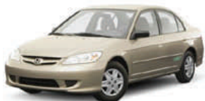
2006 Honda Civic GX

City MPG: 30 Hwy MPG: 34 MSRP for CNG model: $21,760 Transmission/Engine: Automatic (CVT) SOHC 1.7 L