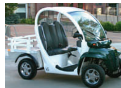
2006 Global Electric Motorcars eS

City MPG: Unavailable Hwy MPG: Unavailable MSRP for Electric model: $6,495 Transmission/Engine: 2.2 kW Cart-Rite electric motor/curtis controller