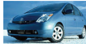
2006 Toyota Prius

City MPG: 49 Hwy MPG: 51 MSRP for Hybrid model: $21,850 Transmission/Engine: CVT 8-Valve SOHC i-vtec 1.3 L