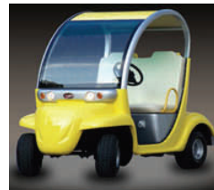
2006 CART-RITE Transporter

The electricity for recharging the batteries can come from renewable sources such as solar or wind energy.