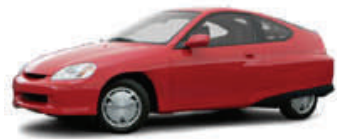
2006 Honda Insight

City MPG: 33 Hwy MPG: 28 MSRP for Hybrid model: Unavailable Transmission/Engine: CVT (DOHC) 24 Valve with (VVT-i) and electric permanent magnet 3.3 L