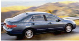
2006 Honda Accord Hybrid

City MPG: 30 Hwy MPG: 38 MSRP for Hybrid model: $30,140 Transmission/Engine: 3.0 L