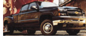
2006 GM Chevrolet Silverado

City MPG: 36 Hwy MPG: 31 MSRP for Hybrid model: $27,515 Transmission/Engine: ECVT Duratec I-4 Atkinson Cycle 2.3L