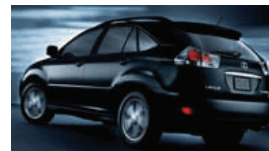
2006 Toyota Lexus RX 400h

City MPG: 60 Hwy MPG: 51 MSRP for Hybrid model: Unavailable Transmission/Engine: ECVT (DOHC) 16 Valve with (VVT-i) and electric permanent magnet 1.5 L