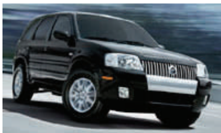
Alvarez Lincoln, Mercury and Jaguar (951) 687-1212

4495 Howard Avenue Riverside, CA 92507 (800) 427-2000