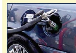
CNG Fuel Pump