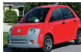
2006 Dynasty Motorcar Corporation IT Sedan

City MPG: Unavailable Hwy MPG: Unavailable MSRP for Electric model: $7,695 Transmission/Engine: direct-coupled Dana Spicer 72 volt shunt GE motor